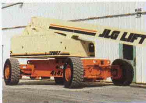
Axles are hydraulically elevated on cylinder jacks for extension to travel widths. Standard four wheel drive and four wheel/crab steer provide the best in power and maneuverability.

Worklights Package, Hostile Environment Kit, Travel Alarm, Rotating Beacon, Cold Weather Package and CSA and EN280 European Packages.