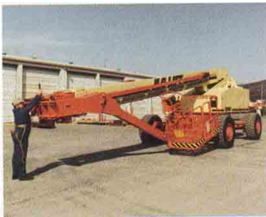
The fly boom tip can be swung around and pinned to reduce transport length.