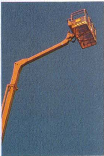
13 ft. (4m) Extend-A-Reach feature increases operator versatility in positioning the work platform.

A high performance telescopic boom lift with extendable axle, JLG's patented Extend-A-Reach, 4-wheel drive and crab steer all as standard equipment. Purpose designed for a wide variety of demanding maintenance, construction and high reach access applications.