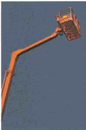
13 ft. (4m) Extend-A-Reach feature increases operator versatility in positioning the work platform.

A high performance telescopic boom lift with extendable axle, JLG's patented Extend-A-Reach, 4-wheel drive and crab steer all as standard equipment. Purpose designed for a wide variety of demanding maintenance, construction and high reach access applications.