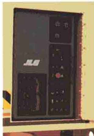
All boom functions are available from ground control as well as a complete set of system gauges. Drive and steer controls are on a remote box for transport loading.

mode is toggle switch selectable to slow down proportional functions for more precise positioning situations . This mode is automatically switched into certain areas of the work envelope. Telescope, platform rotate, platform level and Extend-A-Reach control functions are given an infinitely variable range by a variable speed control wheel. Front Steer, Speed/Torque, Ignition/Start, Auxiliary Power, Emergency Stop, 5 degree Slope Light and dual 110V AC Receptacles are included. 12V DC auxiliary power provides full function operation for lowering in the event of main power loss. Toggle switches are equipped with yellow bats for operator comfort. Individual controls are denoted by large, color coded internationally recognized pictograms set on a darkened panel for high visibility.